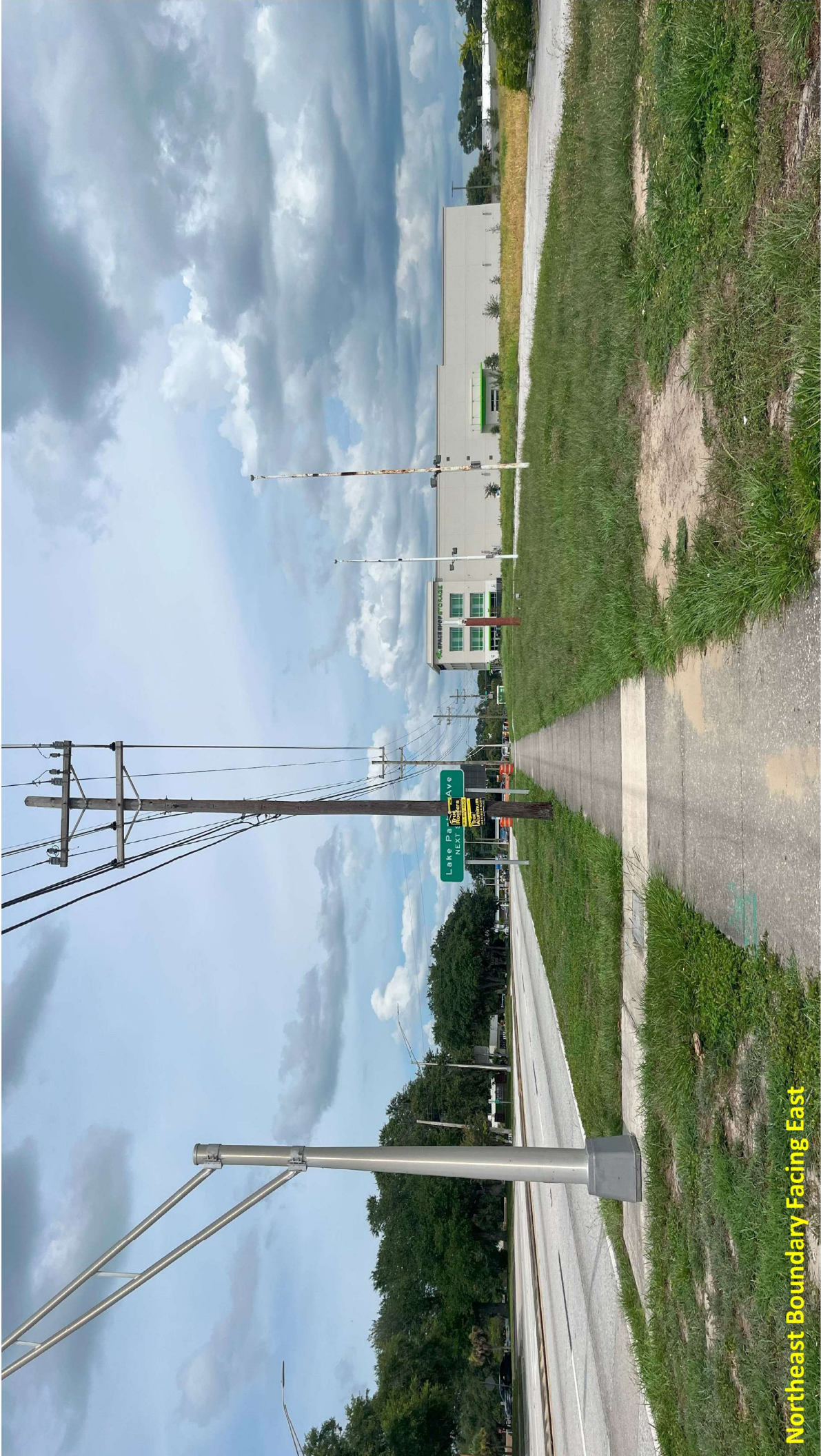
Northeast Boundary Facing East