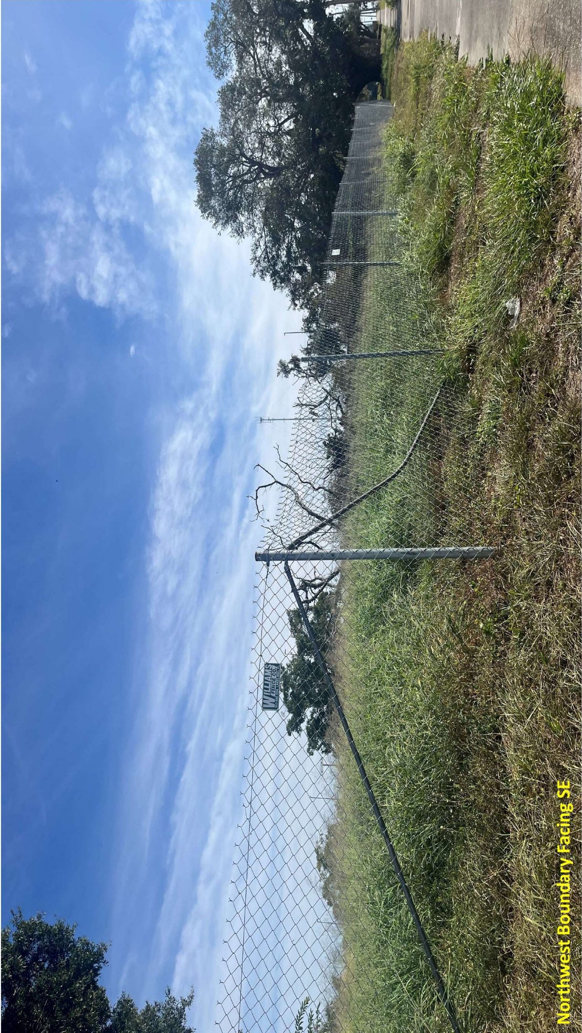
Northwest Boundary Facing SE