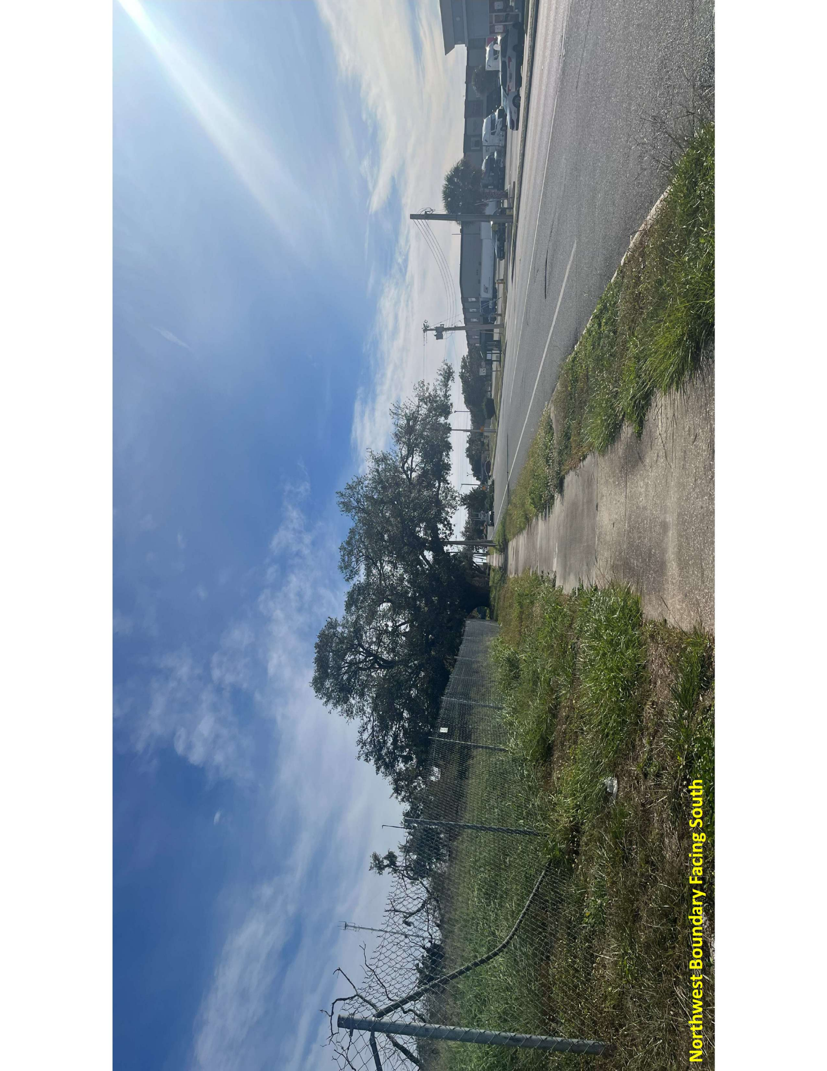
Northwest Boundary Facing South