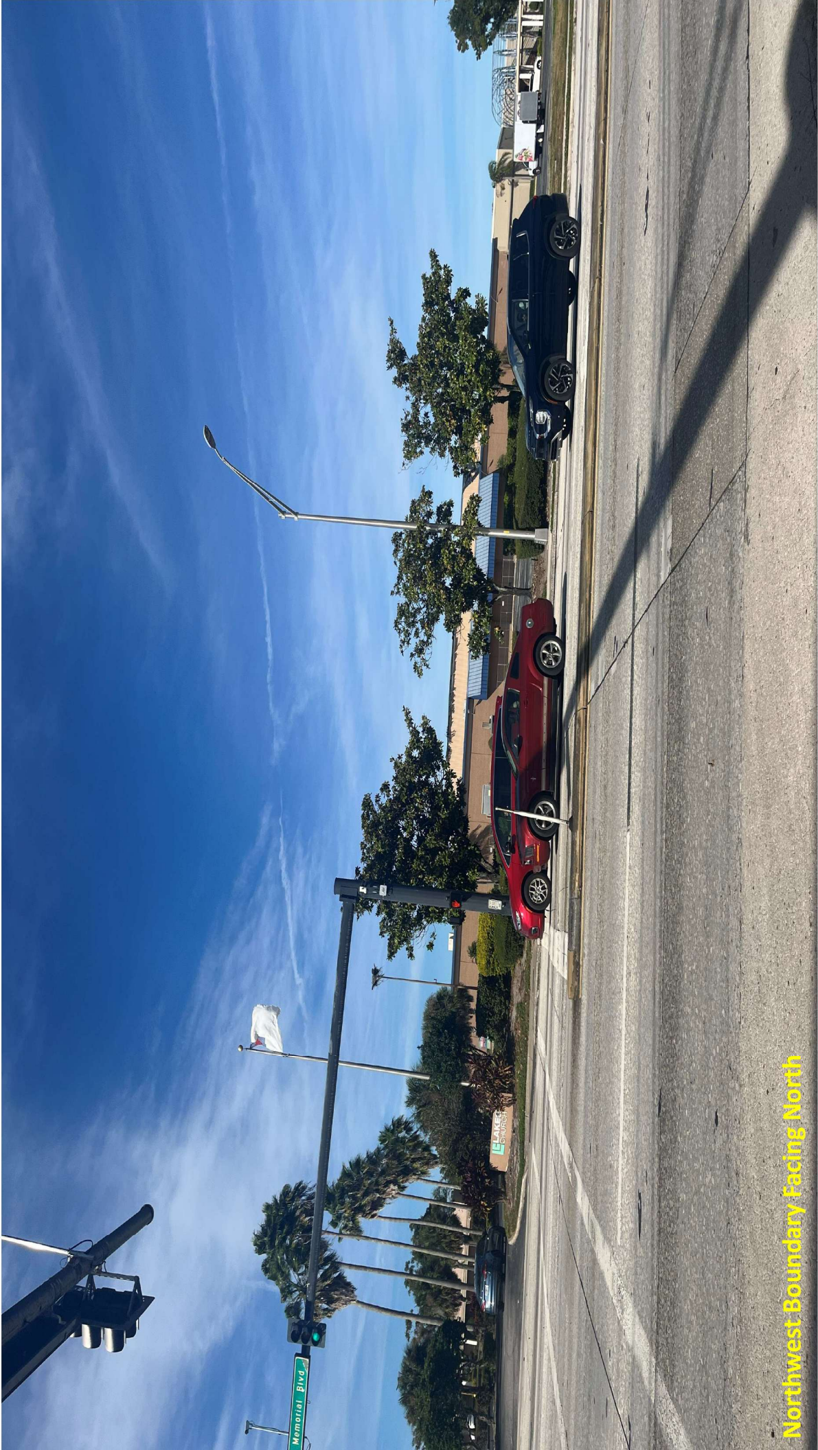
Northwest Boundary Facing North