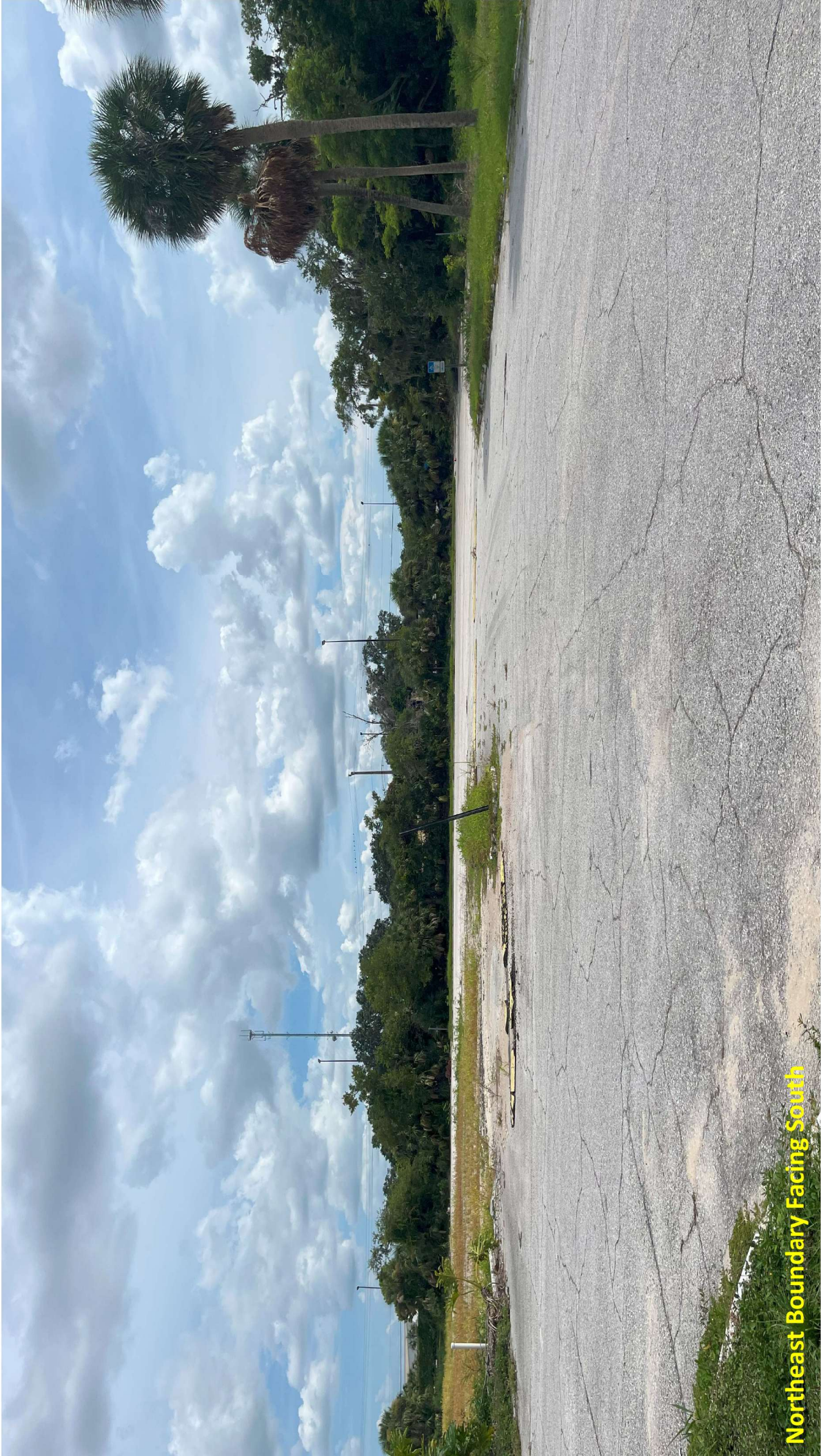
Northeast Boundary Facing South