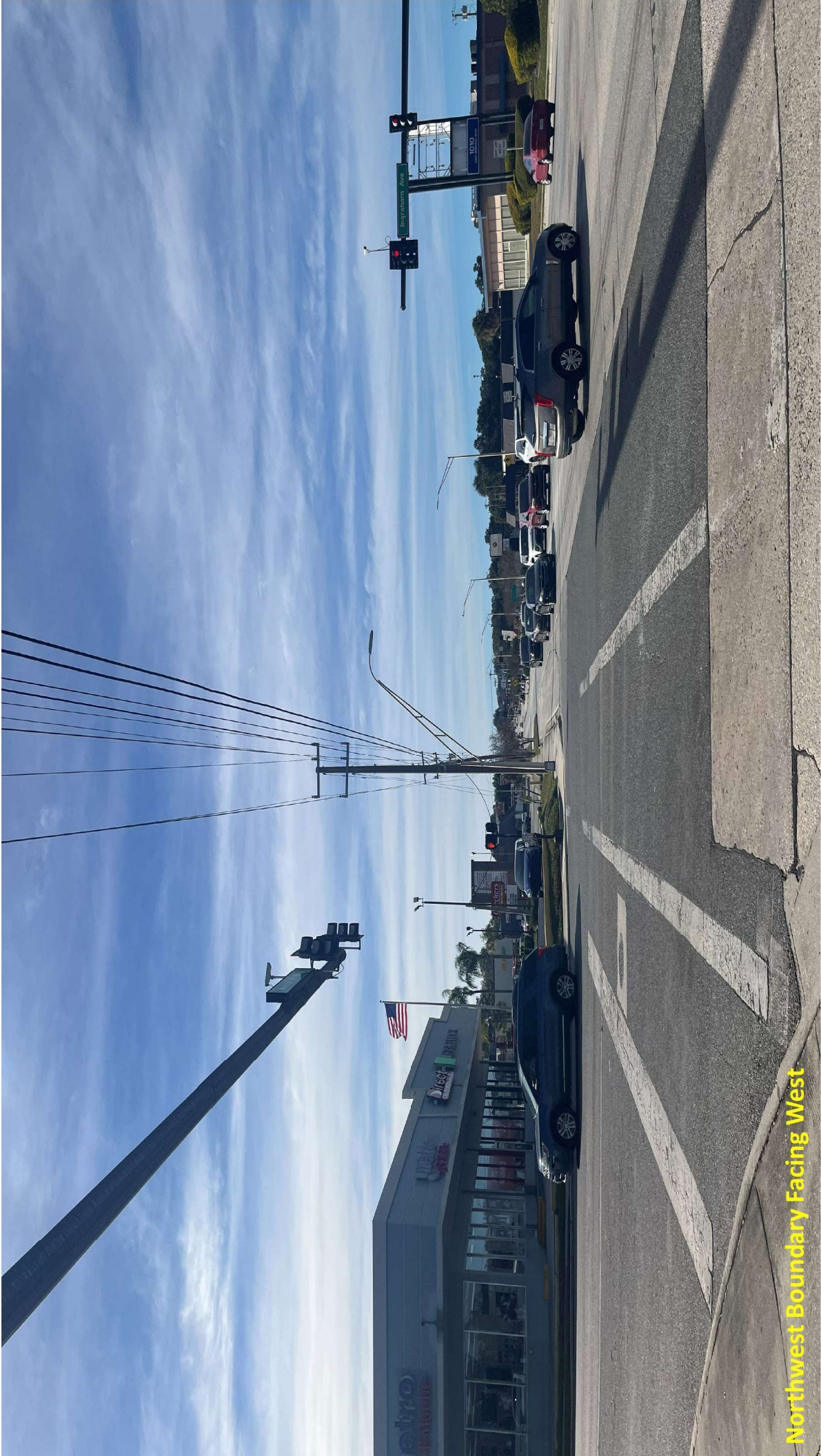
Northwest Boundary Facing West