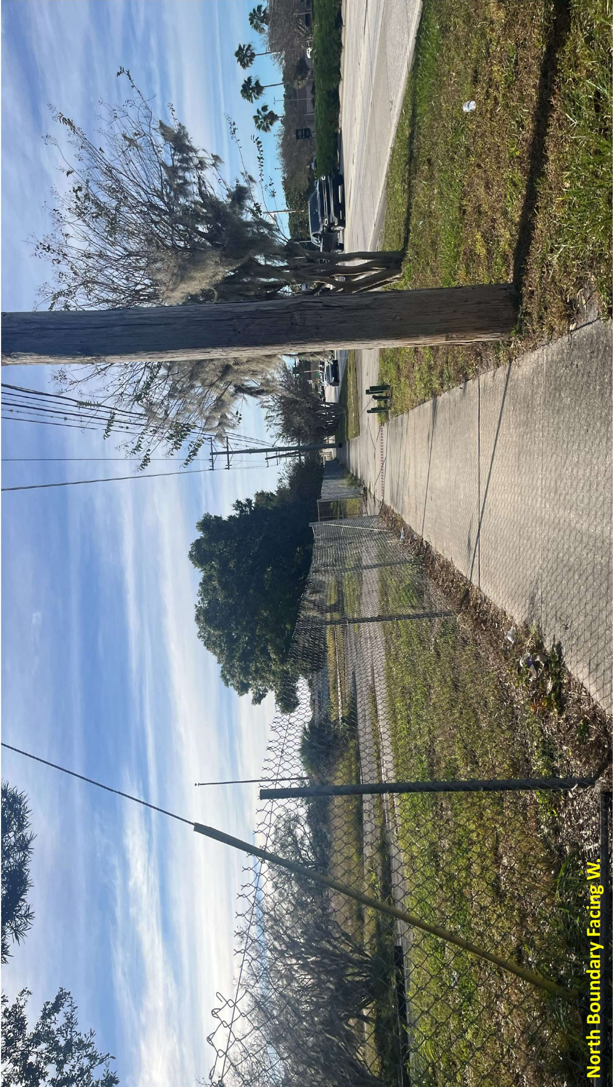
North Boundary Facing W.