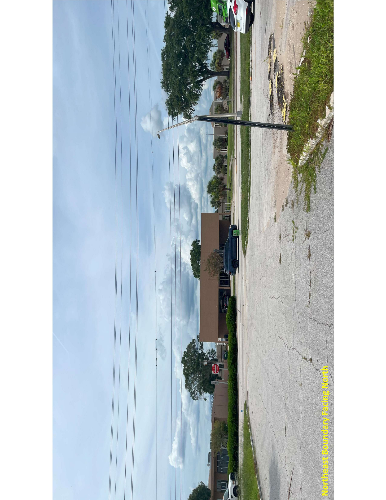
Northeast Boundary Facing North