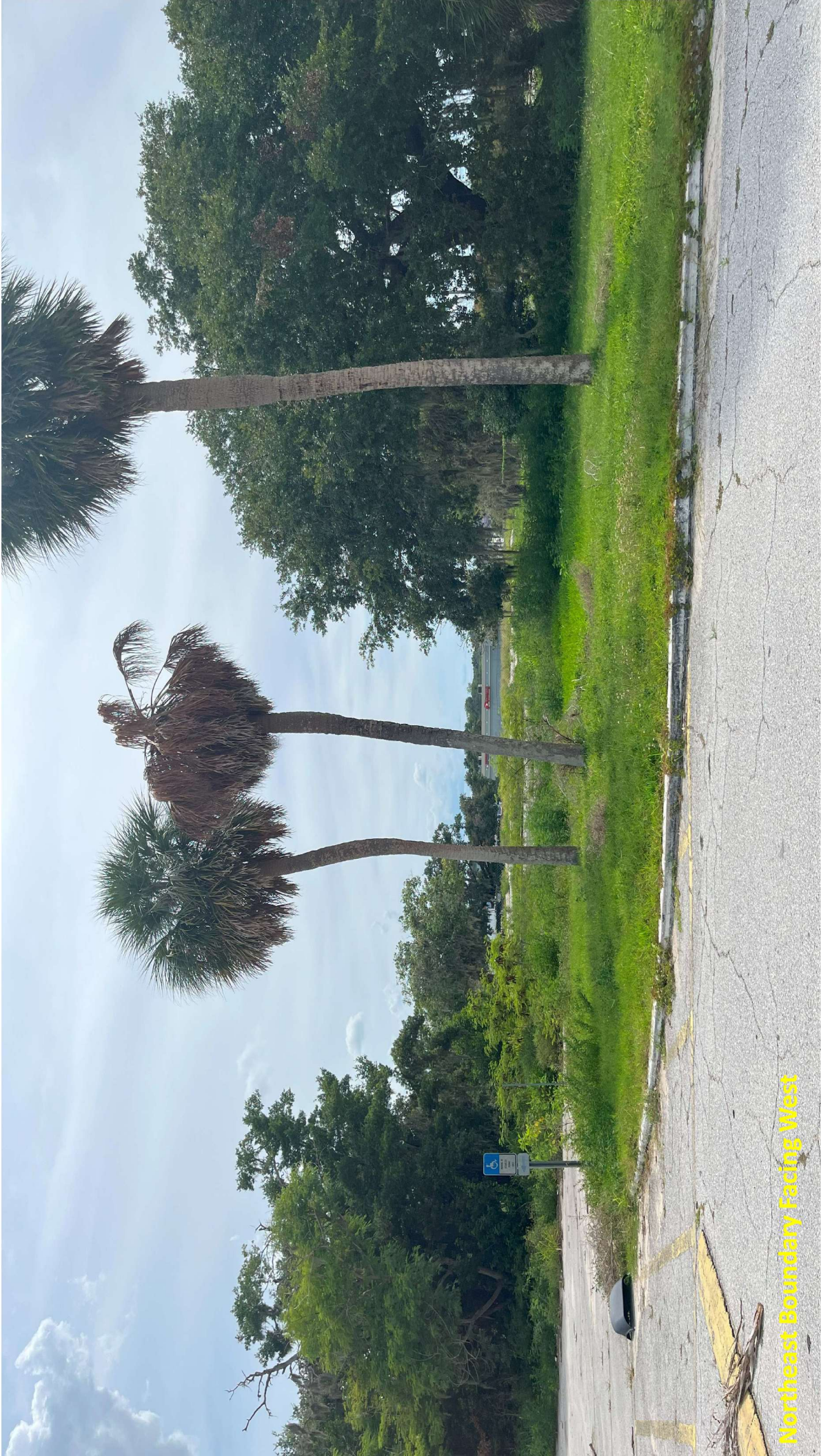
Northeast Boundary Facing West